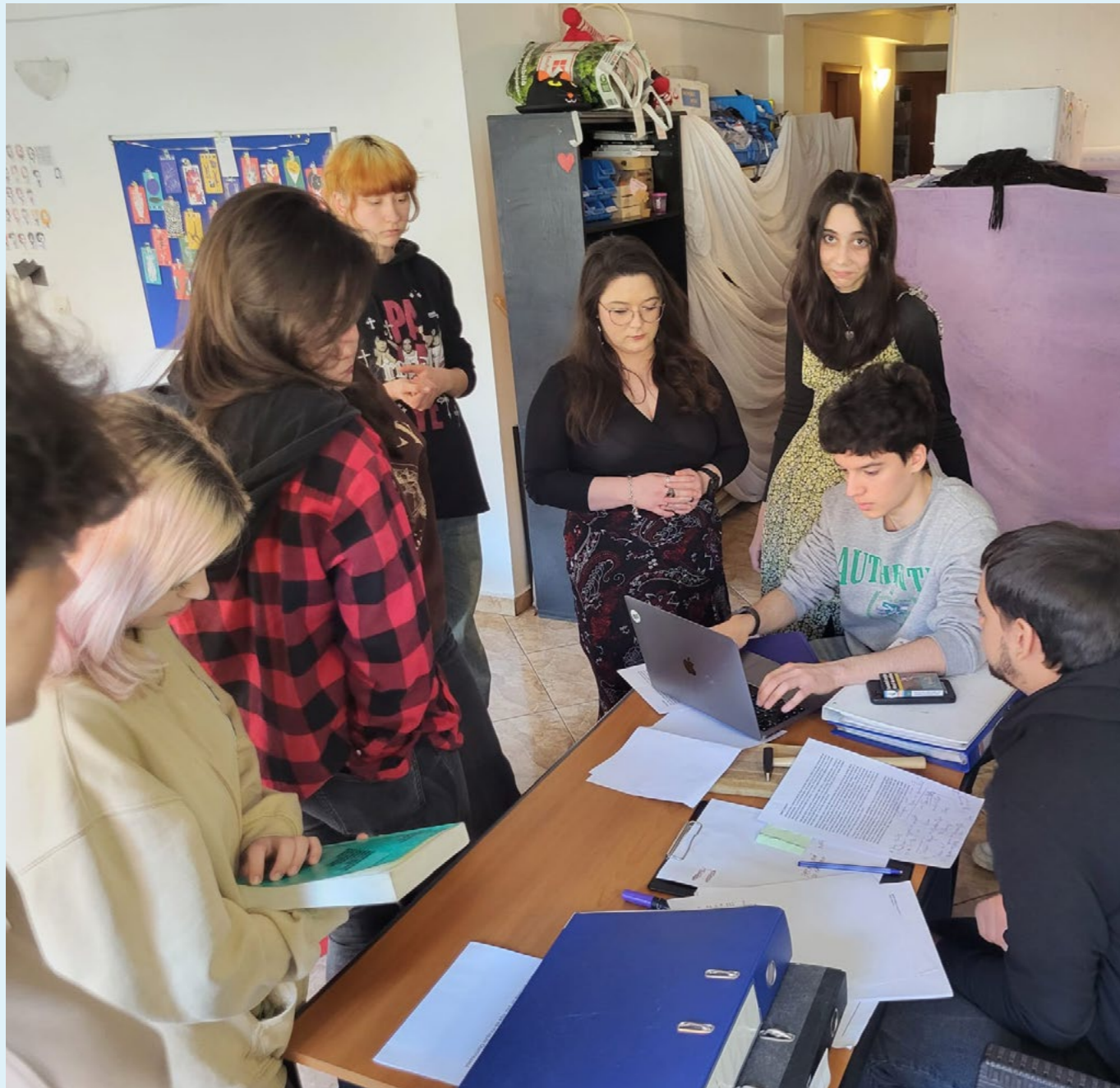
Young people participate in a SRHR peer to peer training in Romania

reinforces harmful stereotypes and norms about sex and sexuality.