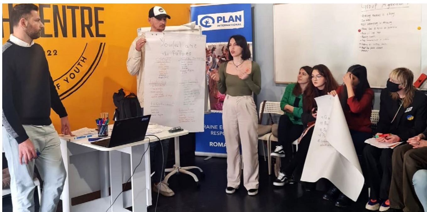
Young people take part in SRHR training in Bucharest

In Romania , interventions also contributed to shifting norms regarding SRHR across participants in marginalised communities. Group and individual sessions created a safe and inclusive environment that encouraged women to prioritise their health and share advice with others. Following the sessions, participants reported feeling more informed about SRHR and becoming increasingly comfortable during SRHR consultations.